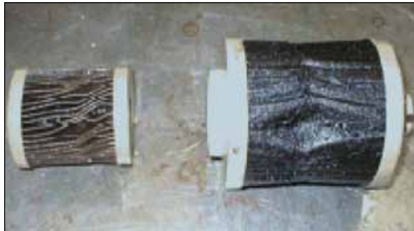
Improperly Maintained Fuel Filters

The pictures below show the difference between properly and improperly maintained 6.0L fuel filters.